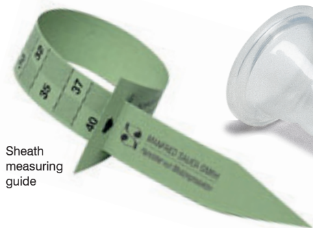
Sheath measuring guide